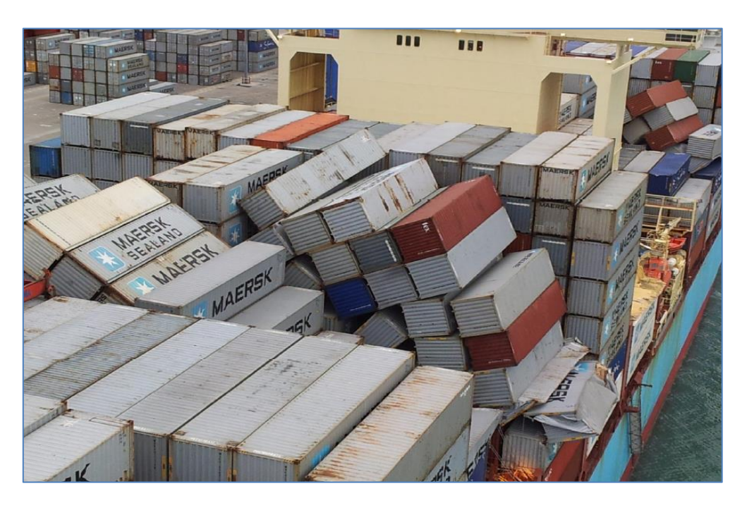
Figure 6 - Svendborg Mærsk, aft deck at arrival

In the early evening, the ship again suddenly rolled violently, reaching an extreme angle of roll of 41° to port. Again a large number of containers were lost over board and the master considered the situation to threaten the safety of the ship. The master sounded the general alarm to muster the crew members. Later in the evening he assessed that the weather no longer posed an immediate danger to the ship.