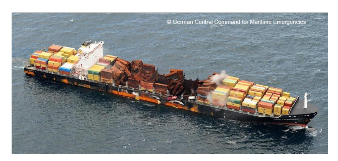
Figure 8 - Fire and explosion on board the MSC Flaminia on 14/07/2012 in the Atlantic Ocean

The alarm indicated smoke in cargo hold 4. The lookout sent from the bridge to the cargo hold confirmed there was fire in the hatch. CO_2 was discharged into the affected cargo hold to fight the fire. The area around cargo hold 4 was to be cooled down later. A team of seven crew members was working in this area to make the necessary preparations when a heavy explosion occurred. This was accompanied by the rapid development of the fire and the ship's command decided to abandon the vessel due to the overall circumstances. The occurrences resulted in three fatalities, two severely injured crew members, structural and cargo damage due to fire. The flag State, Germany, took responsibility for granting a place of refuge on 15 August 2012.