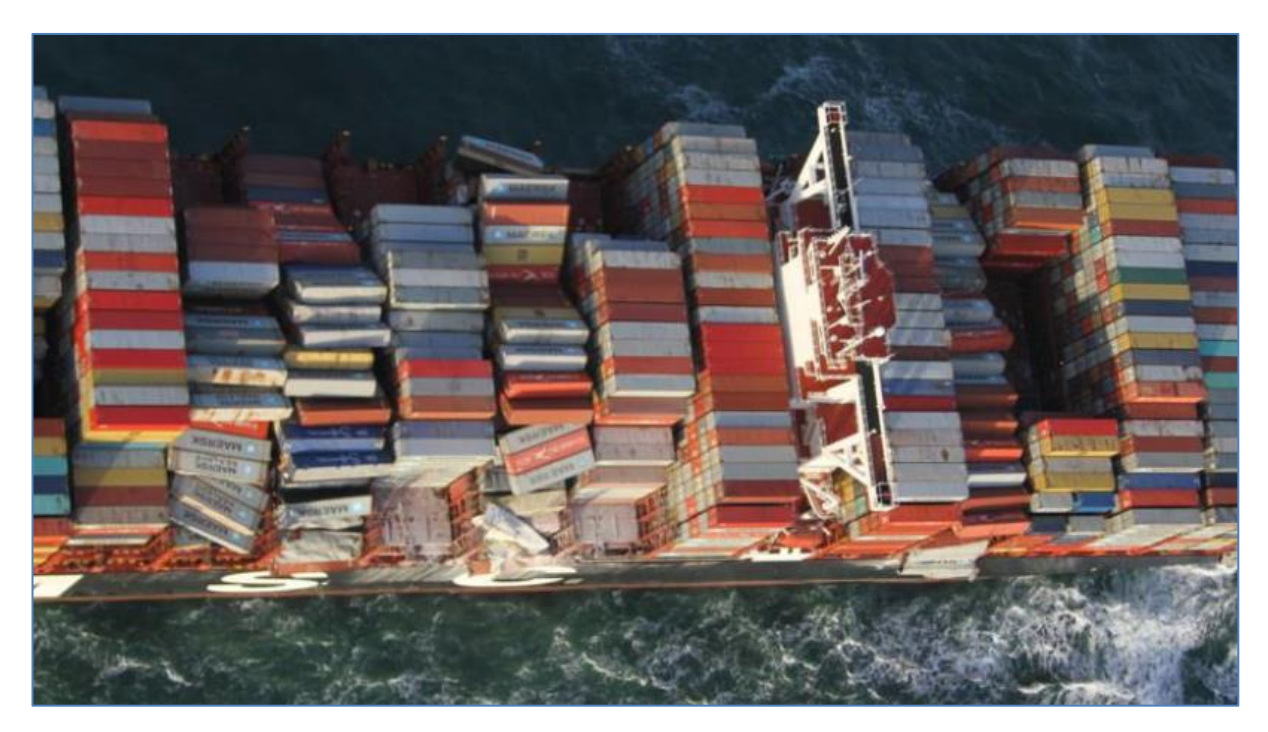
Figure 1 - Top view MSC Zoe following the loss overboard of containers