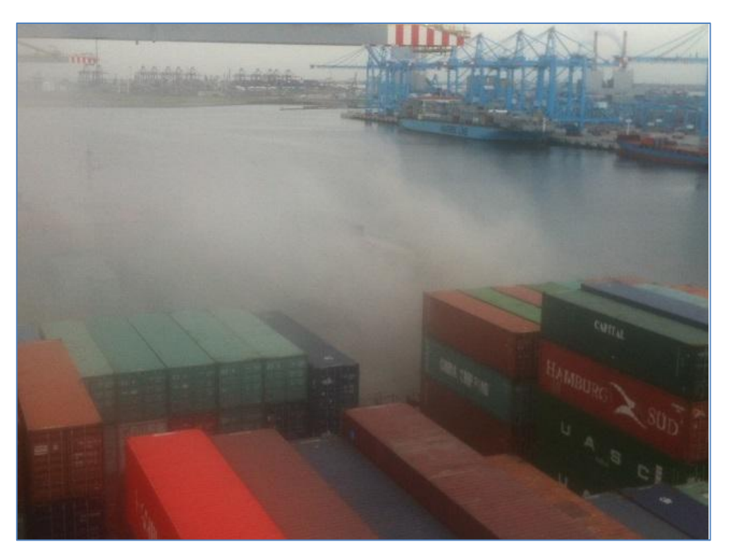
Figure 2 – Smoke from cargo hold nr.2 of MV Barzan on 07/09/2015

This chapter presents the safety issues with a potential horizontal impact on containerships.