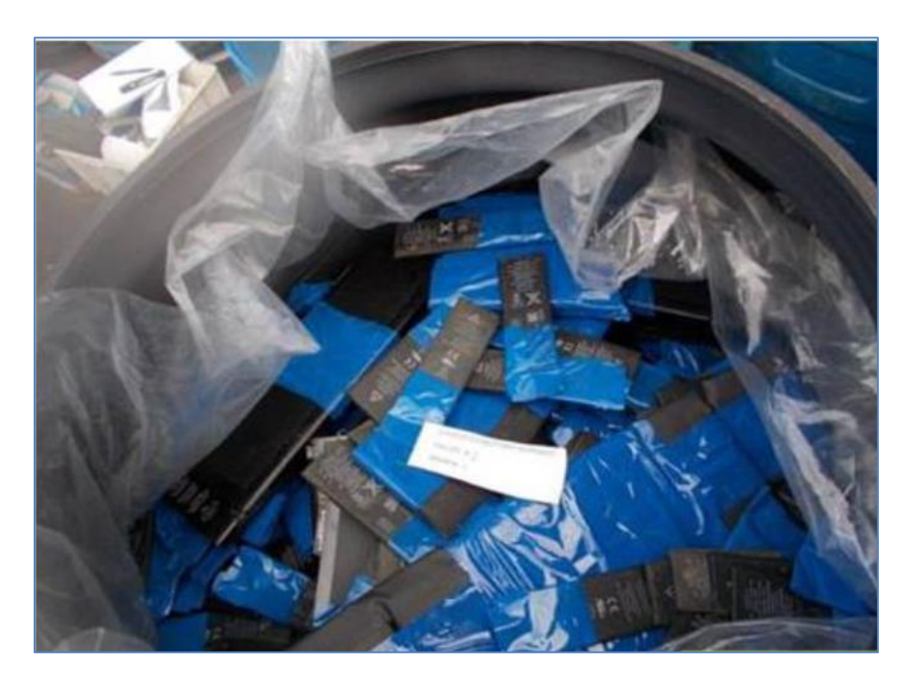
Figure 4 – Example of used lithium-ion batteries cargo loading

On 15 June 2016 CMA CGM Rossini was loading cargo at Colombo (Sri Lanka) when two sailors in charge of lashing securely containers detected a burning smell when they arrived at bay 30 starboard. An explosion occurred coming from the containers loaded in bay 34, in the hold 5 starboard. The officer of the watch was immediately informed and the firefighting procedure enforced. Less than 30 minutes later, a harbour firefighter team arrived on board and the firefighting strategy implemented by the crew was carried on. The source of the fire was one of two 40-foot containers, loaded at Sydney and destined for Antwerp. One of these contained 26 pallets of 104 drums loaded with lithium-ion batteries, which net weigh was 16.692 metric tons.