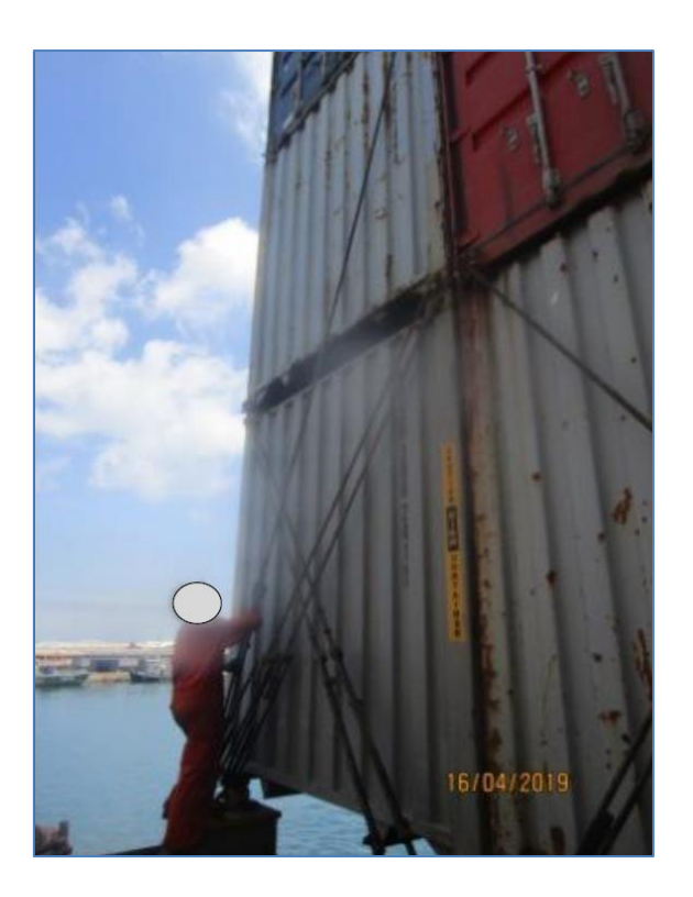
Figure 7 - Connecting a lashing bar to a turnbuckle

off and bleeding from the toe. The lower end of a long lashing bar had fallen onto the seafarer's right foot, cutting through his safety footwear. One toe on the seafarer's right foot was severely injured and had to be amputated.