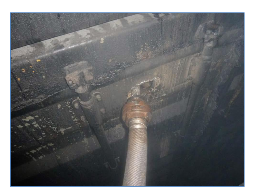
Figure 3 - Burning container on board of Caroline Mærsk with spike nozzle inserted

In the afternoon of 26 August 2015, a fire broke out in a container in a cargo hold on board the container ship Caroline Mærsk. At the time of the accident, the ship was positioned approximately 50 nm from the coast of Vietnam. The fire broke out as a result of charcoal self-igniting in a cargo container below deck. According to the cargo manifest, the contents were described as 'tablet for water pipe'. The IMDG Code states that charcoal is a Class 4.2 cargo, which covers substances liable to spontaneous combustion; however, the cargo of the burning containers had not been declared as dangerous cargo. These facts indicate that the container contents should have been declared as dangerous cargo from the shipper's side, but they were not.